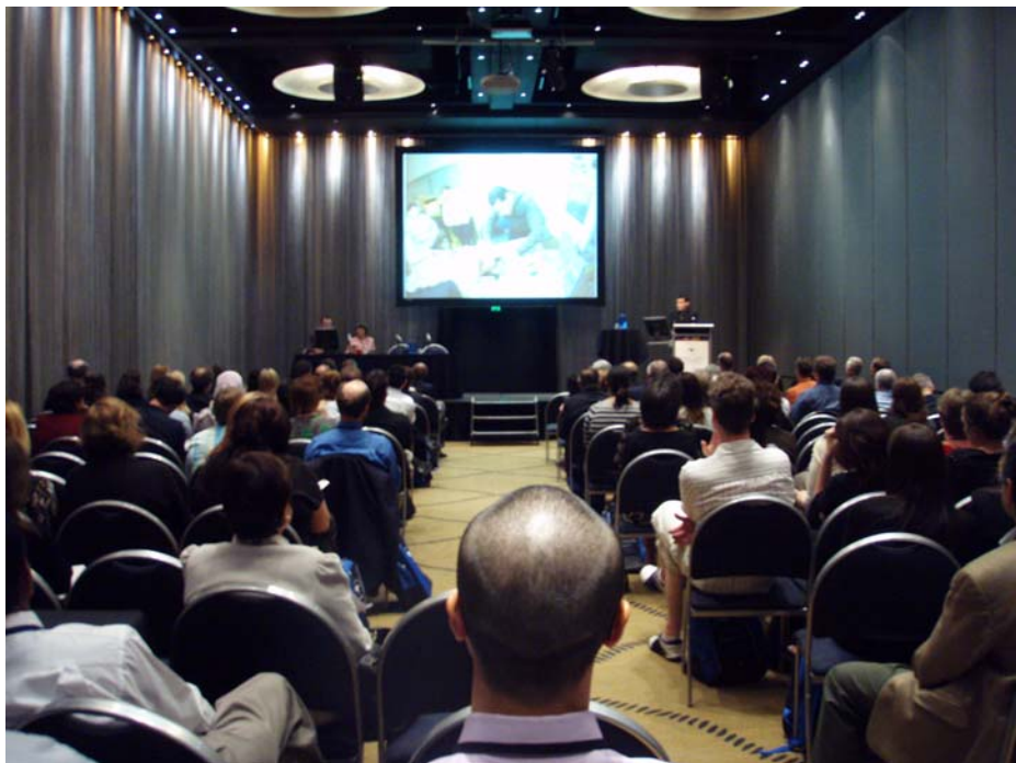
A platform presentation at the 2007 ASM in Adelaide.

The 2007 Annual Meeting was held in Adelaide with over 200 registrants attending the 3-day meeting with four international